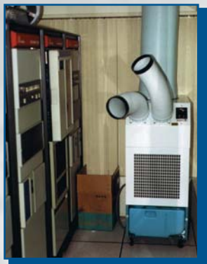
Computer Room Backup